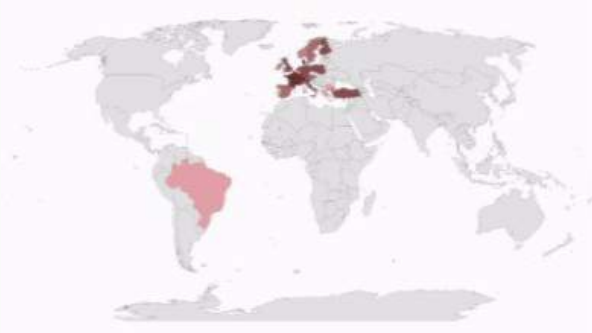
Geographical distribution of FECUND Webinar attendees

The webinar received audience from a wide variety of countries and institutions. Attendees participated interactively by asking questions to the speakers and by sharing their comments at the discussion session.